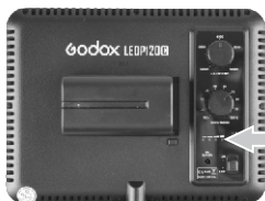
Battery Indicator Button