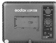
LEDP120C Video Light